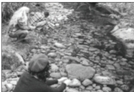
Sharing local knowledge with artists at the Four Winds Creative Field Studies

“The idea behind the field studies is that we immerse artists in nature and present them with a curated program of expert ‘knowledge sharers’— people passionate and well informed about the region’s environment and its history. This transfer of wisdom inspires artists to create