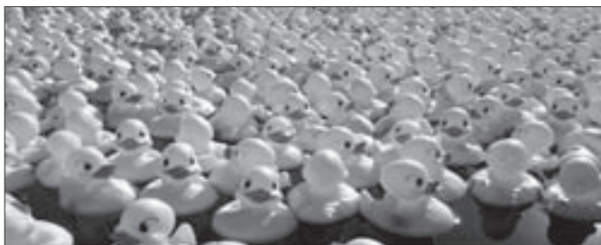
Be a part of the Great Bermagui Duck Race!