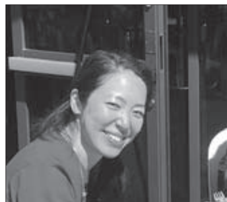
Bermagui will miss you, Kumi!

For more information, check out their Facebook page: CRAB Bermagui Duck Race.