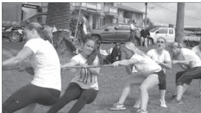
Feel pulled to attend Reboot!