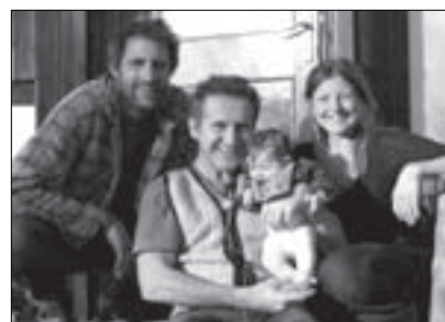
This film will leave you wanting more