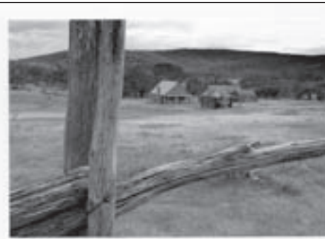
Long Plain Huts, NSW