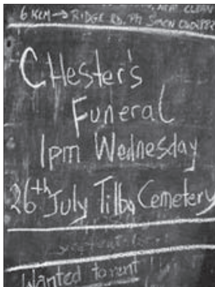
Chester's funeral notice on Bate's Store noticeboard