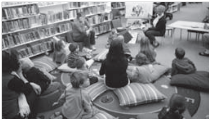
An introduction to the world of ideas: Storytime at Bega Library

Library in 1950s Sydney opened the door to the wonders of the world. After I devoured everything in the children's library, they allowed me, aged ten, to access the adult library. I moved from the Just William books by Richmal Crompton