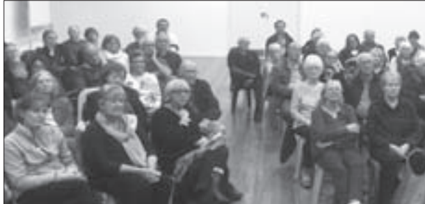
More than 100 people attended!

several major issues they believed the Bermagui Community Forum should address as a priority, including: