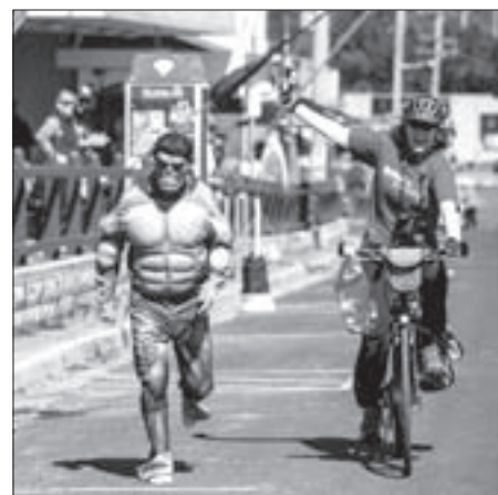
You never know who will appear at ReBoot in Bermagui!

There is something for everyone at ReBoot in Bermagui 2017. Check out the program and register for all events at www.rebootinbermagui.com.au , and follow us on Facebook.