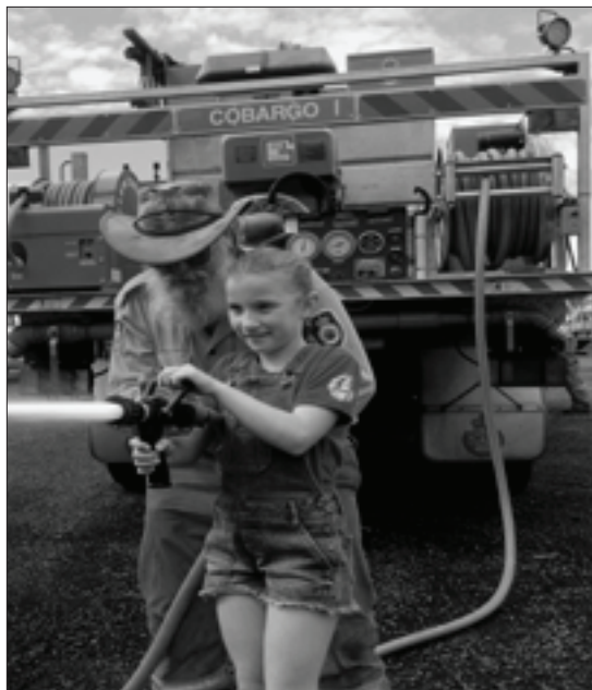
Have a go at Cobargo's "Get Ready" event