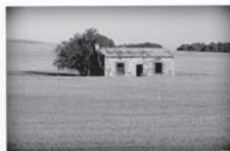
Homestead Ruins, South Australia

so come in and have a look, especially at his beautiful little Western Red Cedar piano key boxes.