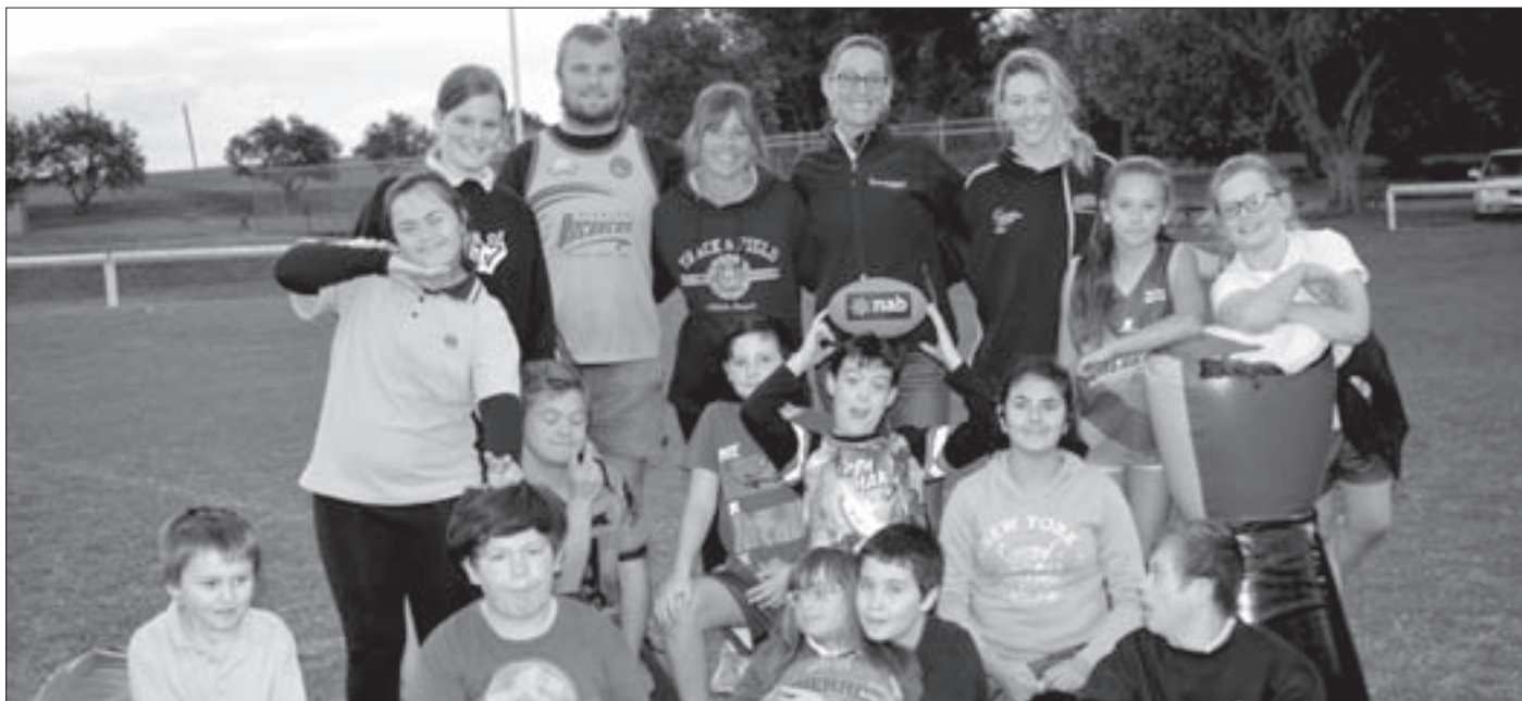
The Kick Ability kids have made huge strides forward with their kicking, catching, hand-balling and tackling skills.

A new Aussie Rules football program called Kick Ability was launched in Bermagui last April by a volunteer organisation called Focus Ability Services. After winning a grant from Ability Links, Bega, this group of mums and dads created a space where kids of any ability could learn football skills in a fun, supportive and inclusive environment.