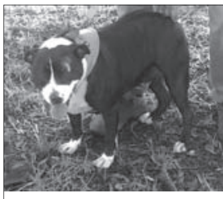
Spud, waiting patiently for his forever home. He's slimmer since this pic was taken!

Spud the very settled six year old Staffy has been waiting patiently for his new home. He will be a great addition to any family but will benefit from a family able to give him some exercise and lots of pats and cuddles. He has been "working out" with his carer so is a little slimmer now than in this photo! Like most Staffies, he prefers to be with his humans most of the time, so a family where someone is home a lot or one prepared to include him in their activities would be best.