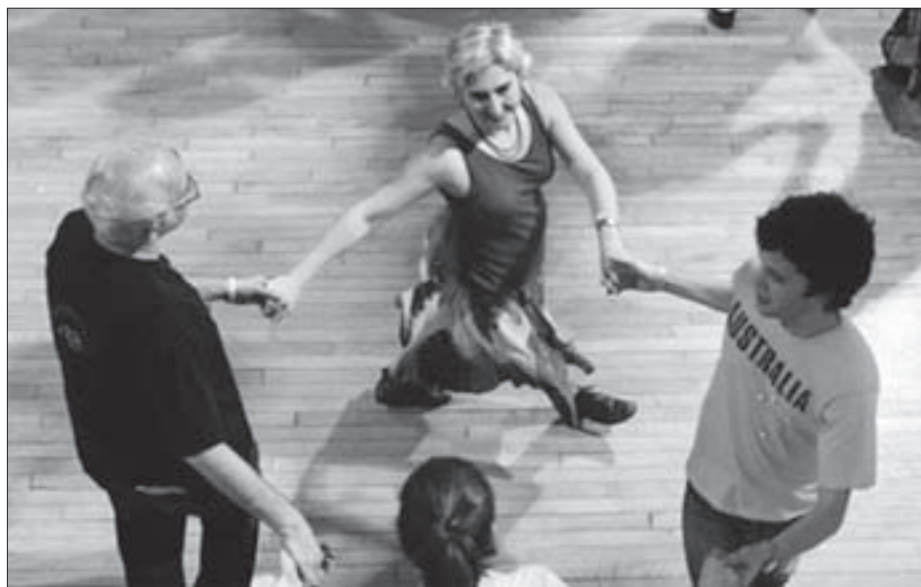
Swing your partner round and round ...

A children's tent will be dedicated to free workshops on plant propagation, candle making, leather work and clay tiny