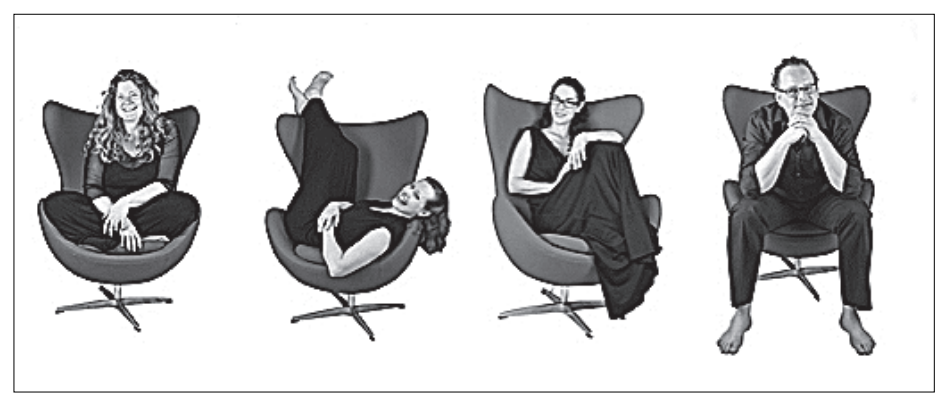
Members of the Acacia Quintet - in residence at the Pavilion 20 September to 6 October