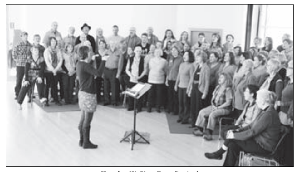
How Can We Keep From Singing?