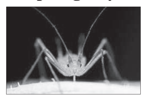
It's time to control aphids in the garden

Native plants in particular are not fond of phosphorus, for example, wherein roses prefer a fertiliser high in potassium that helps them with lush and healthy blooms. Flowering annuals and vegetables prefer a higher rate of both nitrogen and potassium for both lush foliage and big and