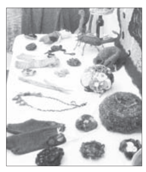
Frayed Edges exhibits

One of the gallery's new directions is beginning a process of installing 'Feature Artists' mini exhibitions, so keep an eye out for these. I believe they will also have a presence at the next Cobargo Farm Open Day, planned for 4 October. More about that next month no doubt.