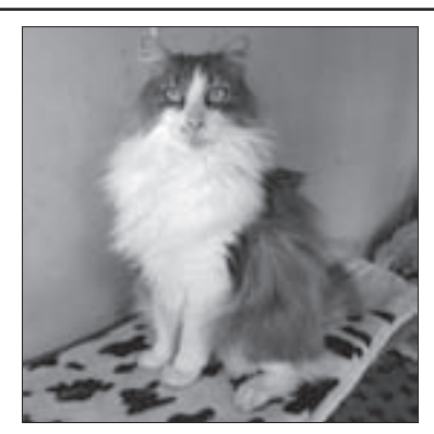
Big Boy, a stylish Domestic Long Hair

Become a member and help the unwanted companion animals in the Bega Valley Shire. New members are always welcome and there are lots of different ways you can help. Please call 0400 372 609 or you can join online at www.awlnsw.com.au